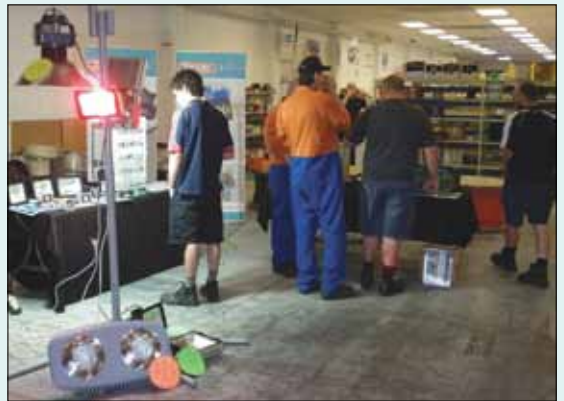
The test measurement range gets attention