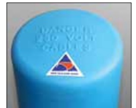
Full Customisation Available