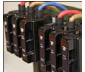
Panels can come pre-populated

Incorporates an aesthetically pleasing profile, TransNet captured torx locking system and the use of industry standard electrical fittings.