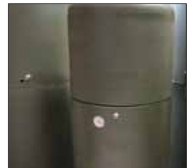
Various Locking Systems