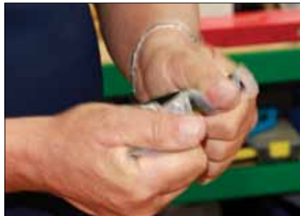
2. No more dangerous Chemicals