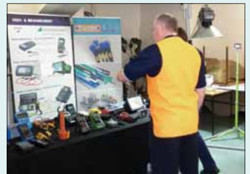
Our Extensive Test & Measurement Range