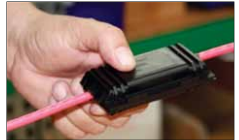
3. 'Clip' the box shut and power it up