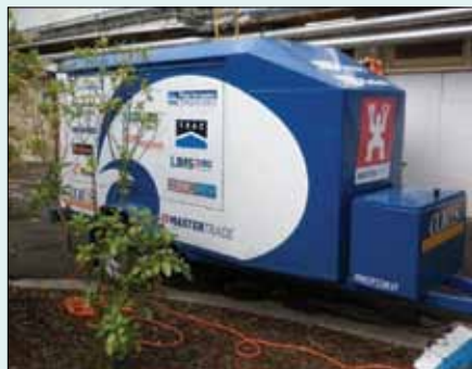
Corys Mastertrade trailer with built in BBQ