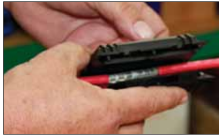
2. Place joint into Raygel enclosure