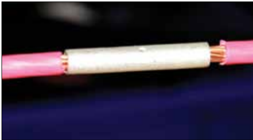
1. Joint the cable in usual manner