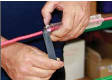
1. No more sealing resin shells