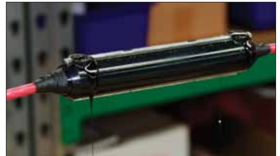
2. No more messy resin