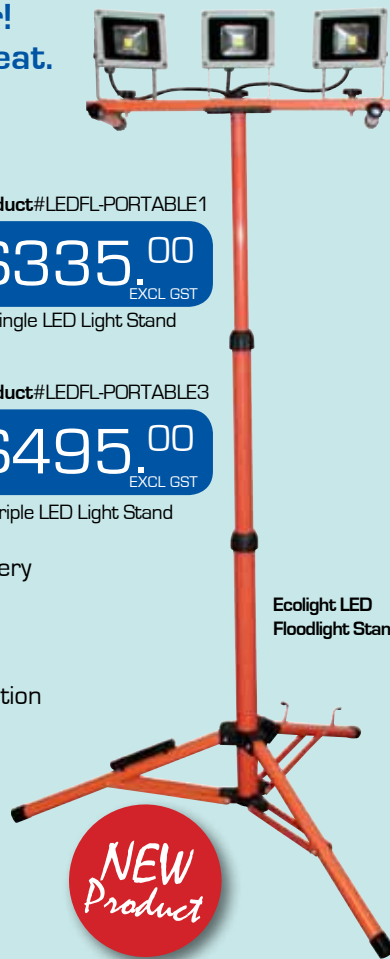
Ecolight LED Floodlight Stand