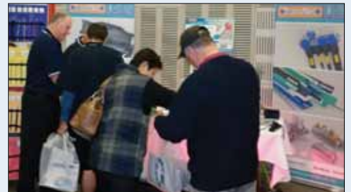
The Waikato JA Russell & FPB Electrical Roadshow

A big thank you goes out to all who took the time to attend the shows and for visiting the TransNet stand to check out the small selection of our vast product range that was on display. Thanks also to the local JA Russell staff members who attended and added their support.