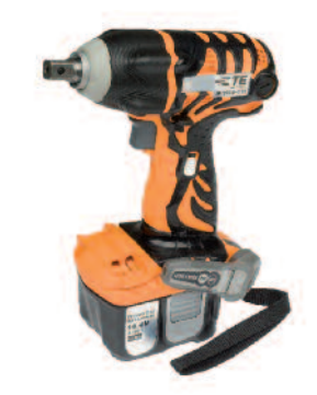
Cordless impact wrench for simple and easy installation of mechanical connectors