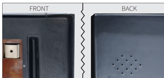
Fully enclosed bus system