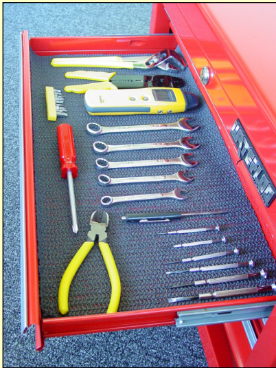
Zerust® Anti-Corrosion Non-Slip Liners are available in 24" x 48" rolls, but can be cut to custom fit your application.

Zerust® Anti-Corrosion Non-Slip Liners combine proprietary Zerust® ICT™ corrosion inhibiting formulations with a non-slip PVC (polyvinyl chloride), a rubberized plastic material, to provide superior corrosion protection and slip prevention. These liners are perfect for keeping tools, metal parts and equipment in place and rust-free! Use with your tool box, work bench, drawers, shelves and other work or storage areas.